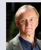
Graham Thornicroft Mental Healthcare System King's College, London, United Kingdom