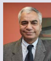
Dinesh Bhugra Social discrimination and social justice for people with mental illness WPA President, London, United Kingdom

The WPA XVII WORLD CONGRESS OF PSYCHIATRY is a top event that you can't afford to miss. From anxiety disorder to obsessive-compulsive disorder, from science to care – over the course of five days the WCP 2017 will gather all the expertise in the field of mental health in one place. Renowned experts have already agreed to participate.