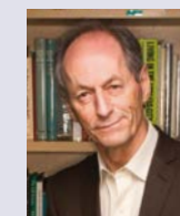
Sir Michael Marmot The health gap: The challenge of an unequal world UCL Institute of Health Equity, London, United Kingdom